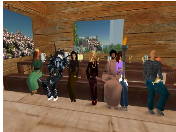
Fig. 2 Snap shot of the Village of Belnap game

By completing the game, students will be able to describe a fourteenth-century village and the roles of its residents, reflect attitudes appropriate to the social role of their characters, and make a historically appropriate argument about the assigned topic. This game consisted of three different sessions. Each session was linked to a certain learning topic.